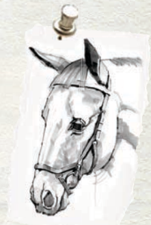
Loved by trainers, loved by horses

The unique shape and positioning of the noseband and back straps allow the bridle to avoid the protruding molar teeth, so sensitive tissue inside the mouth is not damaged.